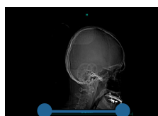
RULER AT BOTTOM