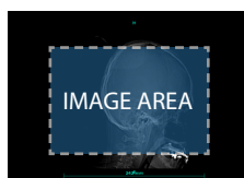
Image Area Controls

Double-click the Help Icon to turn on/off pop-up help that automatically shows available features where ever you hover the cursor.