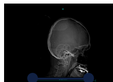
RULER AT BOTTOM