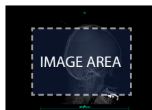
Image Area Controls

Double-click the Help Icon to turn on/off pop-up help that automatically shows available features where ever you hover the cursor.